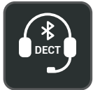
DECT & Bluetooth Hybrid Wireless Technology

The WH64 is a wireless headset for business communication. It integrates DECT and Bluetooth modes, offering efficiency and flexibility. Its advanced acoustic shield technology 2.0 filter out background noise for clear sound transmission. The busylight signals your call status to avoid interruptions. Ergonomically designed for an all-day comfortable wearing experience. With high-quality materials and a lightweight build, it provides a solid experience. It connects seamlessly with IP phones and UC platforms for plug-and-play and device switching. Ideal for clear conversations and smooth office experiences.