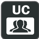
Compatible with mainstream UC platforms