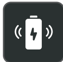
Up to 32 hours Talking Time