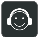
All-day- wearing Comfort