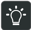
Hybrid Visual Busylight