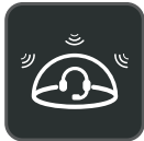
Acoustic Shield Technology 2.0