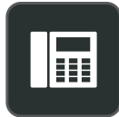
Plug & Play for Mainstream IP Phones