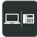
Multiple Devices Connection